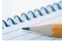
Paper and writing instrument OR print out this sheet